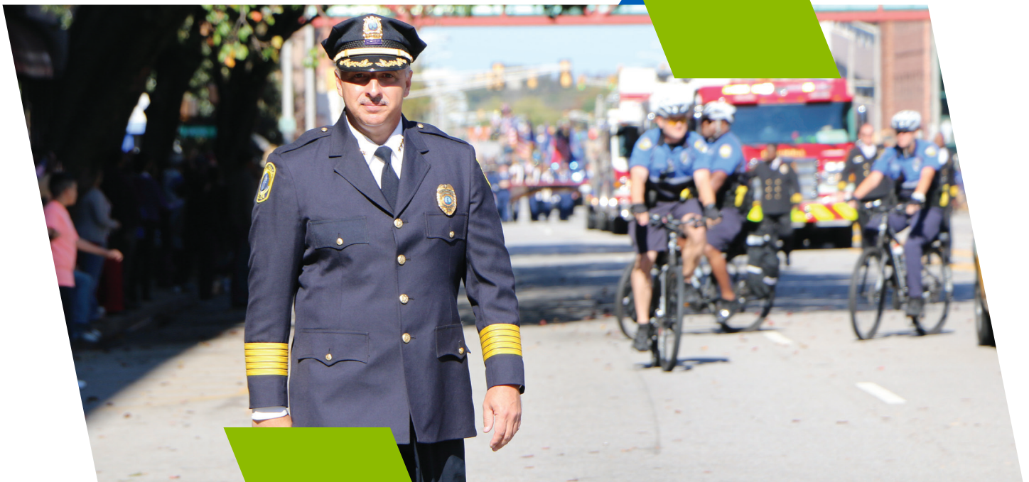
Chief Holbrook and staff attend 2017 Veteran's Day Parade