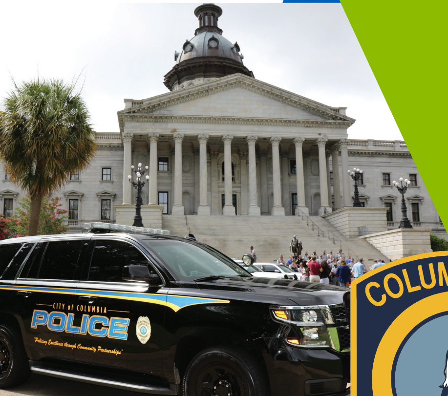
CPD Traffic Safety Division vehicle at SC State House for 2017 Target Zero Kick-off press conference