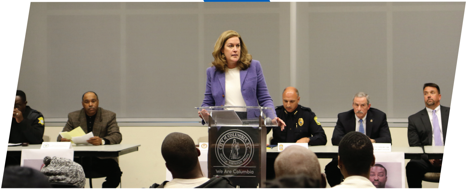
Beth Drake, interim U.S. Attorney for the District of SC, presents information to individuals responsible for gun violence in Columbia during the 2016 Ceasefire Columbia event. All stakeholders in attendance emphasized the importance of the individuals not reoffending, and the consequences if they chose to commit new crimes.